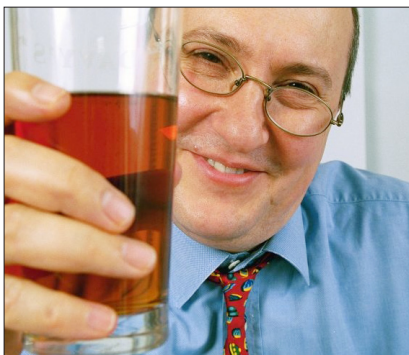
Bottoms up: the anti-radiation plan

Over the following weeks, the jobbing hack was able to parlay his status as the only man in the country who could actually explain radioactivity in terms that laymen could understand into a job with The Daily Telegraph . Unfortunately, by then his exposure to the wind from